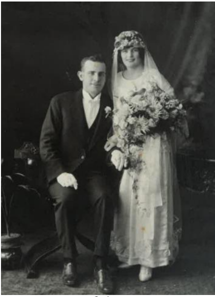
Dad & Mum